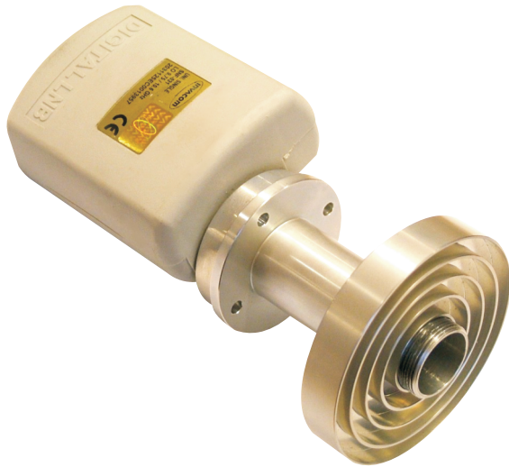
ADF - 120 and LNB