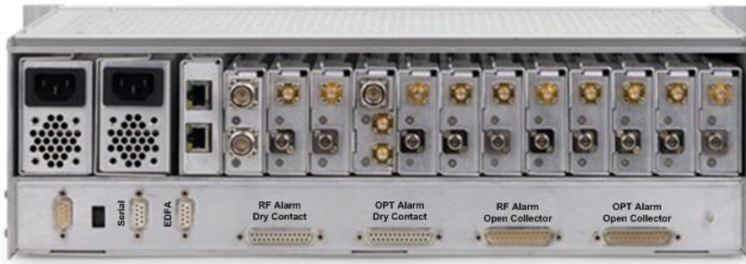
Figure 1: Rear view of 12 Slot Chassis with one MCP slot and dual Power Supply slots