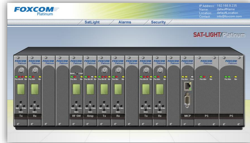
Figure 3: SNMP GUI

The SNMP GUI enables the user to perform detailed monitoring & control of the system, including detection, such as: