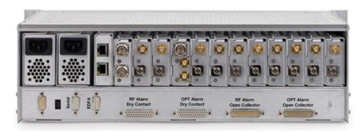
Figure 1: Rear view of 12 Slot Chassis with one MCP slot and dual Power Supply slots