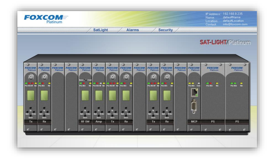
Figure 3: SNMP GUI

The SNMP GUI enables the user to perform detailed monitoring & control of the system, including detection, such as: